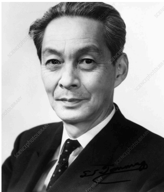
Shinichiro Tomonaga, Japanese physicist

Science Photo Library's website uses cookies. By continuing, you agree to accept cookies in accordance with our Cookie policy . CONTINUE